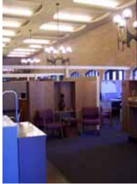
Reception area of our temporary office.

Our headquarters for many years, the Concordia College Outreach Center, will be remodeled into a new enrollment center. Our new office will be located in the college's Riverside Center a few blocks off campus, but that space won't be ready until late summer. Until that happens we're entrenched in temporary digs at Concordia's Grant Center.