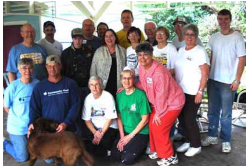
Our group of volunteers who traveled to Camp Victor, Ocean Springs, Miss., to assist with the ongoing rehabilitation in the aftermath of Hurricane Katrina.